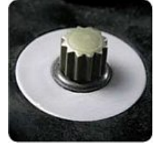
All-metal drive coupling offers long-lasting performance