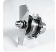
Stainless steel blades quickly cut through ingredients