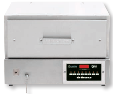
HBK5D1 CVAP® HOLD & SERVE DRAWER WITH FAN

CVap equipment complies with domestic and international requirements such as UL, C-UL, UL Sanitation, CE, MEA, and others.