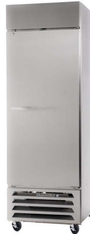
HBR23-1 (SHOWN WITH FULL SOLID DOOR) Full Glass Door model available

MODEL: HBR23-1 / HBR23-1-G HBR27-1 / HBR27-1-G HBR49-1 / HBR49-1-G HBR72-1 / HBR72-1-G