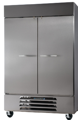
HBR49-1 (SHOWN WITH FULL SOLID DOOR) Full Glass Door model available