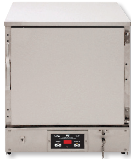
HC4009 CVAP® HOLDING CABINET HALF SIZE, UNDER COUNTER MODEL, FANLESS Electronic Differential Control

CVap equipment complies with domestic and international requirements such as UL, C-UL, UL Sanitation, CE, MEA, and others.