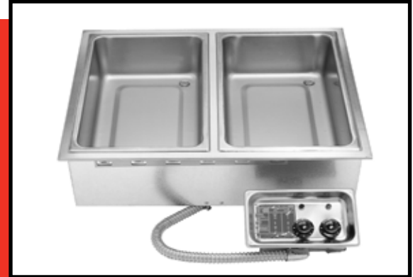
Top Mount w/EZ-Lock