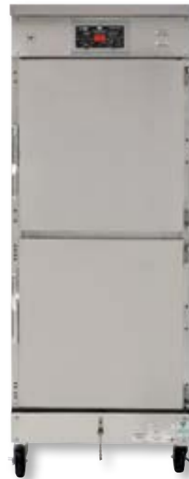
HL4522-AL CVAP® HOLDING CABINET FULL SIZE MODEL, WITH FAN Electronic Differential Control

CVap equipment complies with domestic and international requirements such as UL, C-UL, UL Sanitation, CE, MEA, and others.