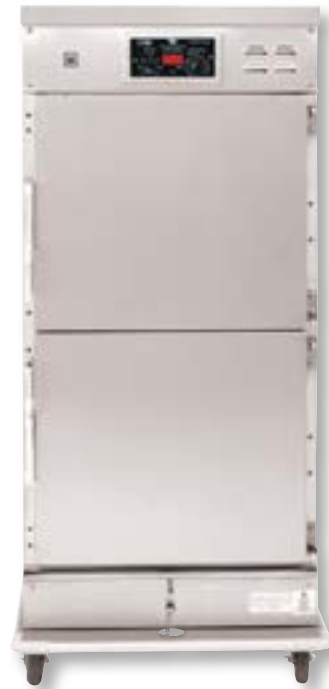
HMA018 CVAP® HOLDING CABINET FULL SIZE MODEL, FANLESS Electronic Differential Control

CVap equipment complies with domestic and international requirements such as UL, C-UL, UL Sanitation, CE, MEA, and others.