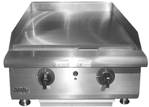
Model HMG-2424 Heavy Duty Manual Griddle

The interior combustion chamber is heavy-duty heat resistant 11-and 16-gauge steel, and is hand-welded for strength and durability. Standard features include stainless and aluminized steel exterior, spatula-width front grease trough, stainless steel landing ledge and large capacity, slide-out grease pan. Additional features include individual 3/4" NPT rear gas connection in natural or LP gas, pressure regulator and 4" (102mm) NSF approved legs with adjustable bullet feet. Stainless steel splash guards are continuously welded to the griddle plates.