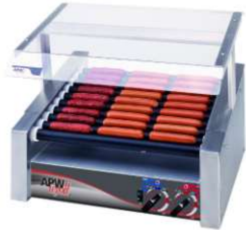
Model: HRS-31S Roller Grill with SGXP-31 Sneeze Guard