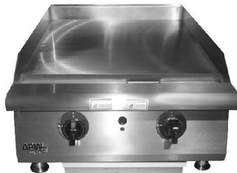
Model HTG-2424 Heavy Duty Thermostatic Griddle