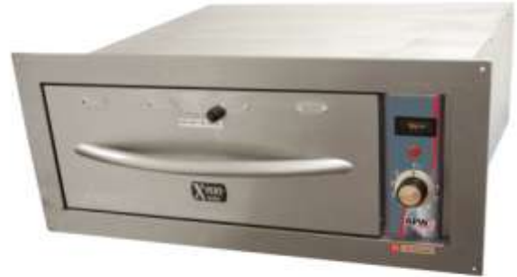
Model: HDDi-1B Built-in Holding Drawer