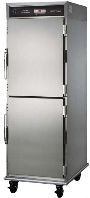
HHC-900 with SimpleHold controls and right-hand hinged doors.

Henny Penny Corporation PO Box 60 Eaton OH 45320 USA