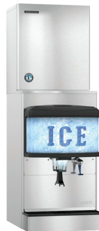
FS-1022MLJ-C on DM-4420N