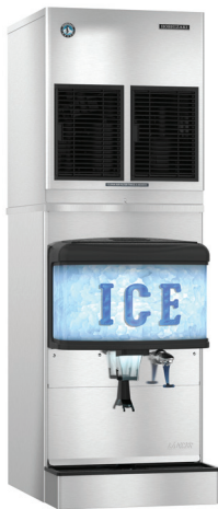
FD-650M_J-C on DM-4420N