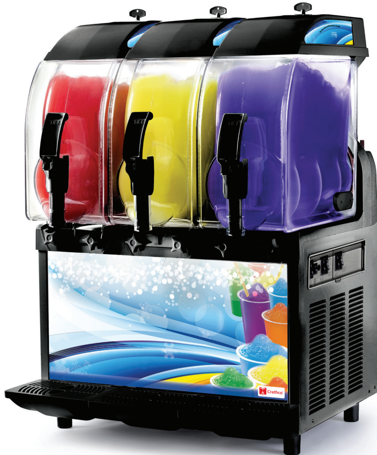
model I-PRO 3M with light panel