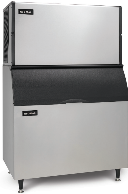
ICE2106 ON B100