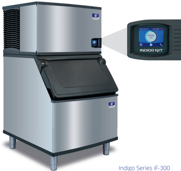
Indigo Series iF-300 Ice Machine on D-400 Bin

Designed for operators who know that ice is critical to their business, the Indigo@NXT Series ice machine's preventative diagnostics continually monitor itself for reliable ice production. Improvements in cleanability and programmability make your ice machine easy to own and less expensive to operate.