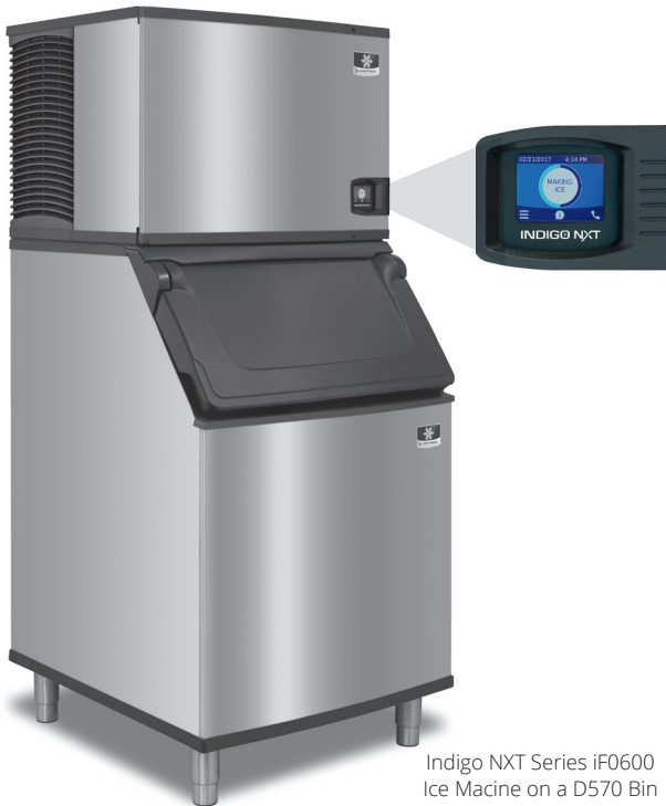
Indigo NXT Series iF0600 Ice Machine on a D570 Bin

Model: IDF-0600A IYF-0600A IDF-0600W IYF-0600W IDF-0600N IYF-0600N