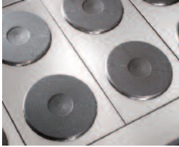
9" (229 mm) sealed round plate elements with easy to clean flat surface.

IR-6-E IR-G36T-E IR-6-E-C IR-G36T-E-C IR-6-E-XB IR-G36T-E-XB