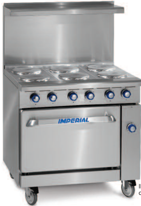
IR-6-E shown with optional casters