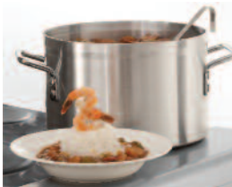
Large 5" (127 mm) stainless steel landing ledge for convenient plating.