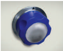
Durable cast aluminum with a Valox™ heat protection grip.