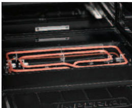
5.3 KW element provides even heating throughout the oven cavity.