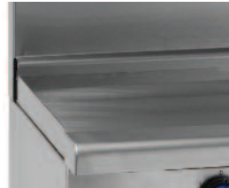
Thick steel polished griddle plate for even heating across the entire surface.