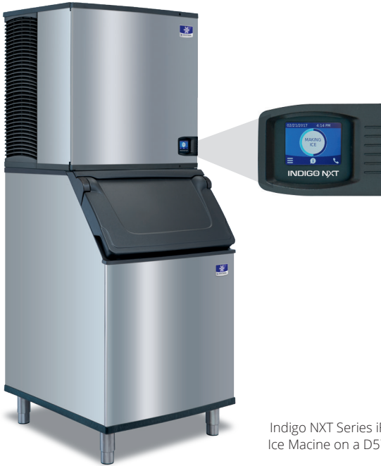
Indigo NXT Series iF0900 Ice Machine on a D570 Bin

Designed for operators who know that ice is critical to their business, the Indigo ® NXT Series ice machine's preventative diagnostics continually monitor itself for reliable ice production. Improvements in cleanability and programmability make your ice machine easy to own and less expensive to operate.