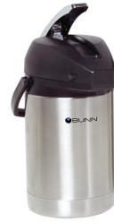
AIRPOT, 2.5L SST LA 6/ CASE