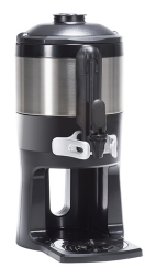
TF SERVER, 1G MECH GEN3