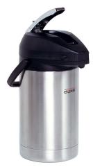
AIRPOT, 3.0L SST LA SINGLE PK