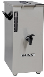
TD4T, BREW THRU LID NO DECAL NUDGER HDL