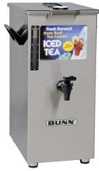
TD4T, BREW THRU LID NUDGER HDL