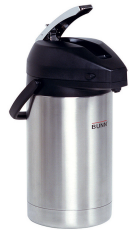
AIRPOT, 3.0L SST LA 6/ CASE