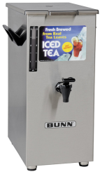
TD4T, SIGHT GAUGE NUDGER HDL