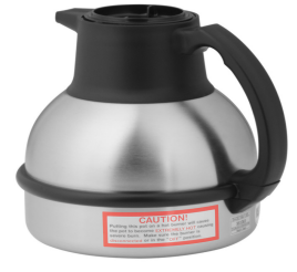
THERMAL CARAFE, ORN 1.9L 12PK