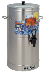
TDS-3, 3 GAL