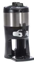
TF SERVER, 1G DSG GEN3