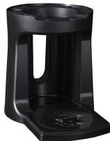
STAND ASSY KIT, TF SERVER