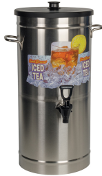
TDS-3.5, 3.5 GAL