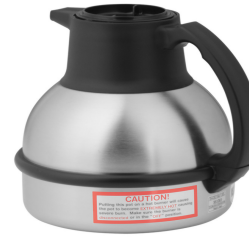
THERMAL CARAFE, BLK 1.83 L 1PK