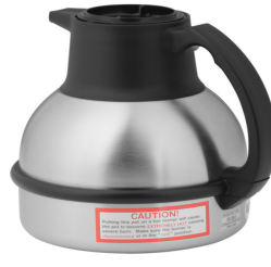
THERMAL CARAFE, BLK 1.9L 12PK