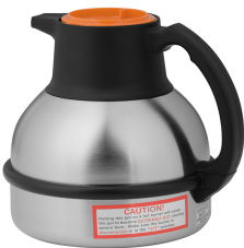
THERMAL CARAFE, ORN 1.9L 1PK