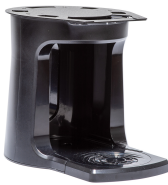
NON-LOCKING STAND ASSY, TF SERVER GEN3