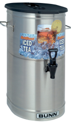
TDO-4, RESERVOIR BREW THRU