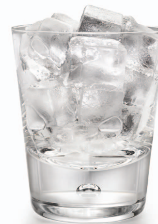
Global Product Guide

11100 East 45th Avenue • Denver, CO 80239 phone 800.423.3367 • fax 303.371.6296 www.iceomatic.com