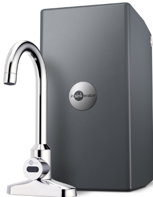
Deck mounted faucet configuration