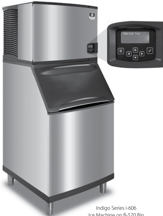
Indigo Series i-606 Ice Machine on B-570 Bin

Designed for operators who know that ice is critical to their business, the Indigo™ Series ice machine's preventative diagnostics continually monitor itself for reliable ice production. Improvements in cleanability and programmability make your ice machine easy to own and less expensive to operate.