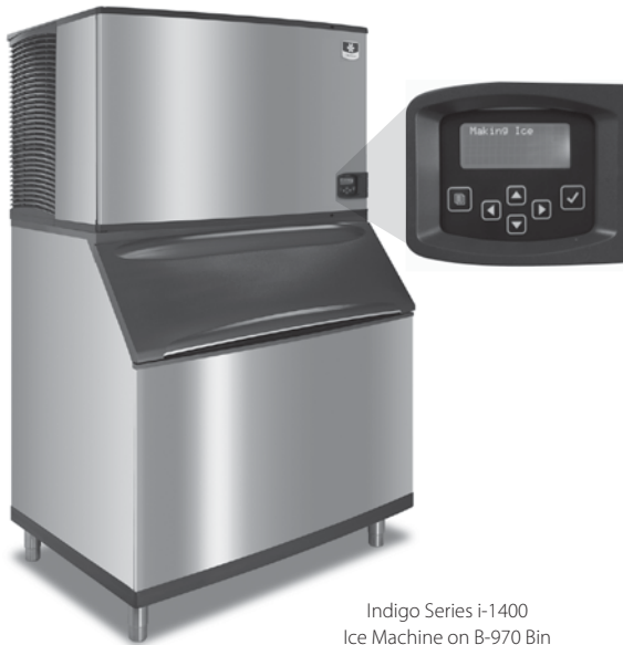
Indigo Series i-1400 Ice Machine on B-970 Bin

Designed for operators who know that ice is critical to their business, the Indigo™ Series ice machine's preventative diagnostics continually monitor itself for reliable ice production. Improvements in cleanliness and programmability make your ice machine easy to own and less expensive to operate.