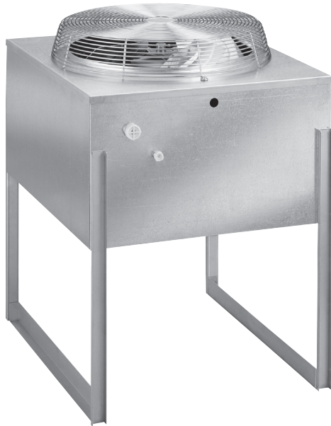
JCF900 Remote Condenser