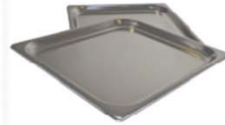
JOF-23 Aluminum Pan W: 14" D: 12-3/4"