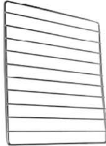
JOF-23 Wire Shelf W: 14" D: 12-3/4"