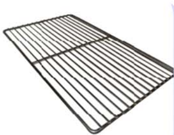
JOF-ONE Wire Shelf W: 23-1/2" D: 15-3/4"