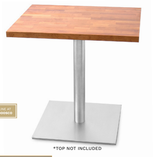
*TOP NOT INCLUDED