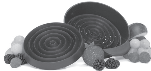
Small fruit insert / attachment to juice berries and other soft fruits is included with all Athena™ Juice Presses.