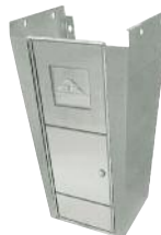
Add Trash Receptacle To 7-PS-33, 7-PS-37 or 7-PS-37B 7-PS-29

Pedestal Base with 10" x 14" Bowl and Deck Mounted Faucet 7-PS-37