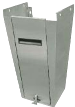
With Foot Valve 7-PS-33