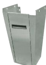
Pedestal Base Only 7-PS-37B

Pedestal Base with 10" x 14" Bowl and Deck Mounted Faucet 7-PS-37