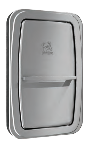
KB311 Vertical Surface Mount