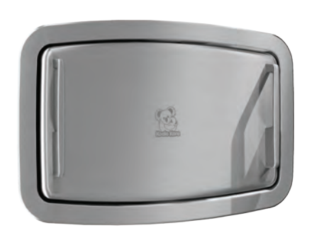
KB310 Horizontal Recessed