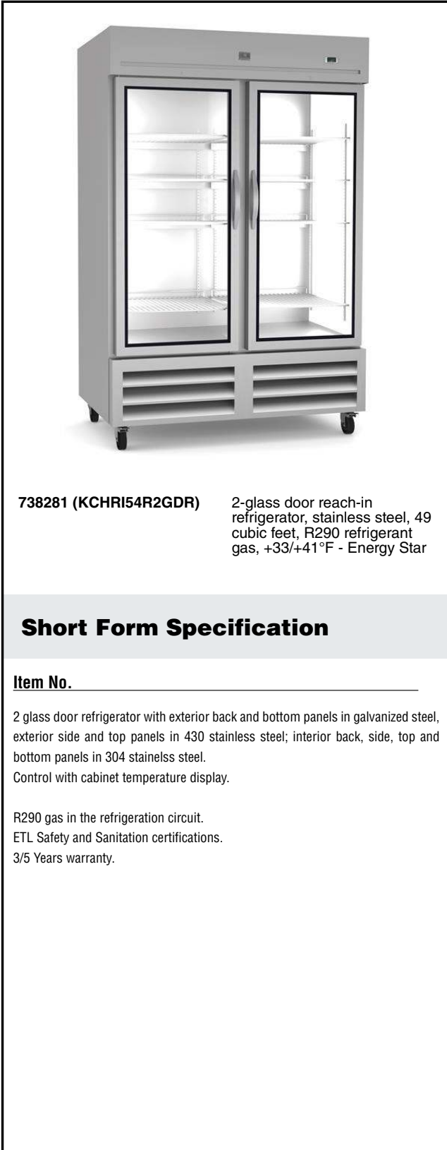
738281 (KCHRI54R2GDR) 2-glass door reach-in refrigerator, stainless steel, 49 cubic feet, R290 refrigerant gas, +33/+41°F - Energy Star