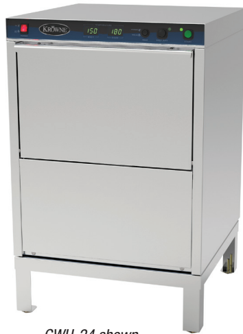
GWH-24 shown Rack stand included