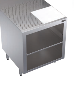
KR24-GSB4 Middle Shelf/Cutting Board (2 racks)