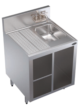
KR24-24SC Storage with Hand Sink