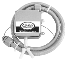
Low Chemical Alarm