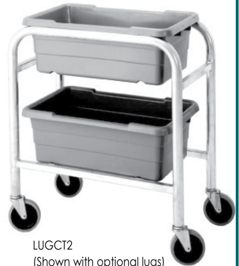
LUGCT2 (Shown with optional lugs)