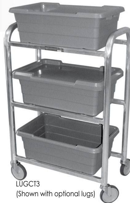
LUGCT3 (Shown with optional lugs)