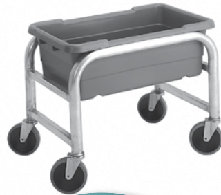
LUGCT1 (Shown with optional lug)