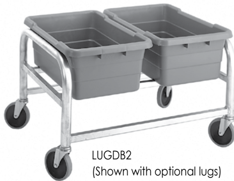
LUGDB2 (Shown with optional lugs)