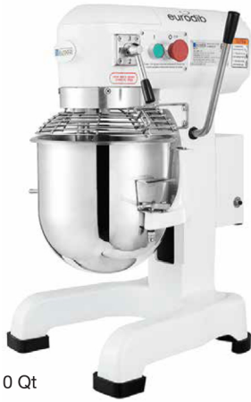
M10 ETL - 10 Qt

★ M10 ETL , M20 ETL and M30 ETL are NOT SUITABLE for pizza, pita or bread dough. Stop the machine to change speed. Do not mix dough at middle or high speed.