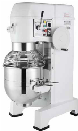
M60A 220ETL - 60 Qt