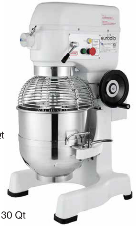
M30 ETL220 - 30 Qt