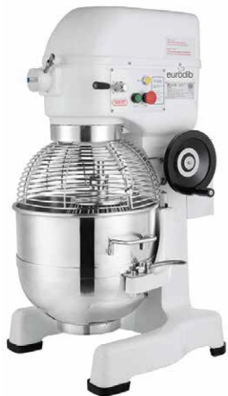
M40A 220ETL - 40 Qt