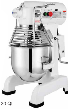
M20 ETL - 20 Qt