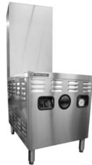
100 & 200 BTU 24" Cabinet Base Steam Boiler Shown with Flue Riser

Manifold gas pressure shall be 4" W.C. (102mm) for natural gas and 10" W.C. (254mm) for LP Gas. Incoming pressure must not exceed 14" W.C. (357mm).