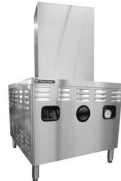
300 BTU, 36" Cabinet Base Steam Boiler Shown with Flue Riser