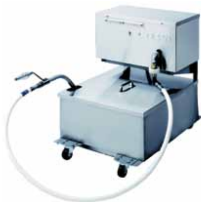
MF90AU/80 Micro-Flo Portable Oil Filter