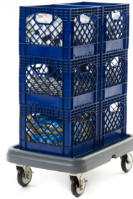
Dolly designed to hold milk crates.