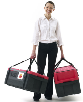
MLS1 Carrying Strap