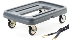
MLD1 Dolly (includes strap)