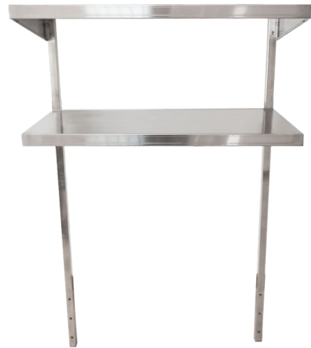
MROS-2RE / MROS-3RE

MROS-2RE / MROS-3RE / MROS-4RE MROS-5RE / MROS-6RE