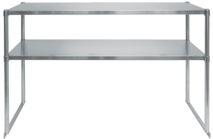
MROS-4RE / MROS-5RE / MROS-6RE