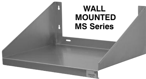
WALL MOUNTED MS Series