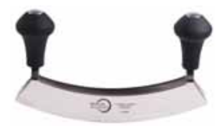
M18928 8" Mezzaluna, rubberized knob handles