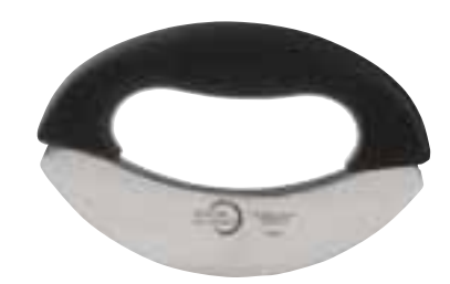
M18927 7" Mezzaluna, rubberized one-piece handle