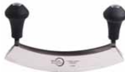
M18928 8" Mezzaluna, rubberized knob handles