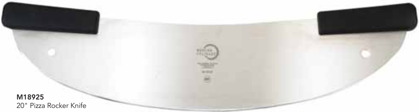
M18925 20" Pizza Rocker Knife