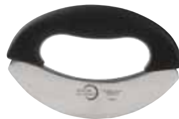
M18927 7" Mezzaluna, rubberized one-piece handle