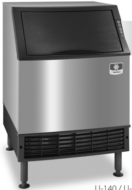
U-140 / U-190