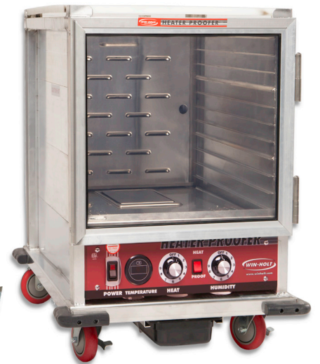
NHPL-1810HHC Fits under counters and tables.

For replacement parts please see page 143.