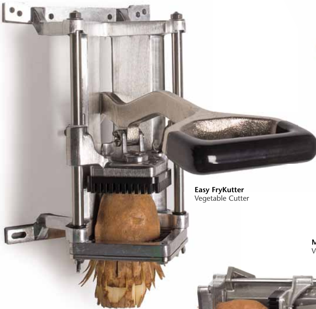
Easy FryKutter Vegetable Cutter

Choose Easy FryKutter for labor savings and improved productivity. Or power through the biggest spuds at lightning speed with the one and only Monster FryKutter.