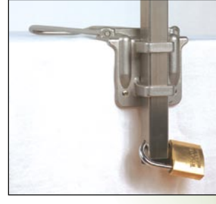
Stainless steel permanent mount model—screws into the countertop. The security model option (shown) includes a locking capability. (Lock not included.)

Can-locking feature (holds up to #10 cans) easily orients and holds the cutter to the lid.