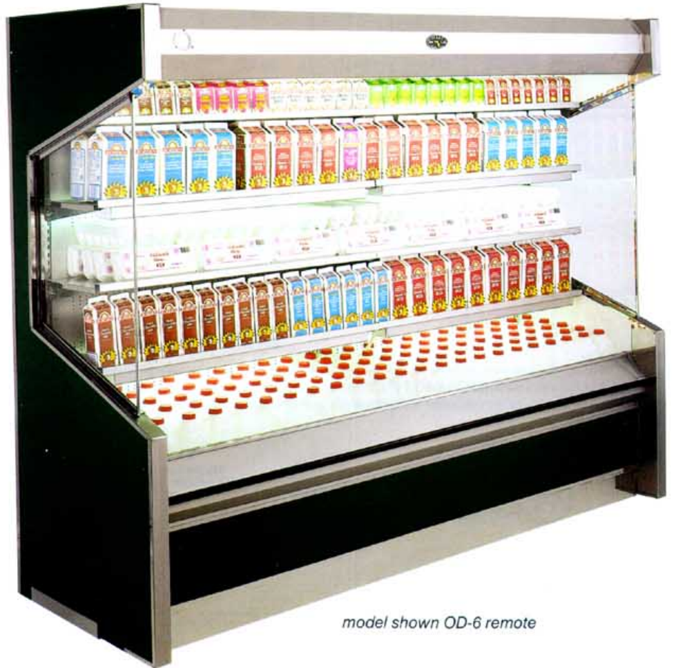
model shown OD-6 remote