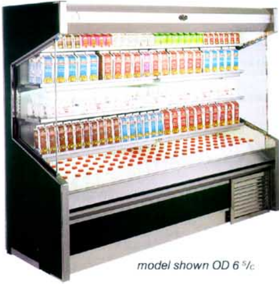
model shown OD 6 5/8