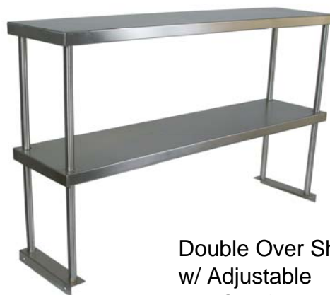
Double Over Shelf w/ Adjustable Mid Shelf