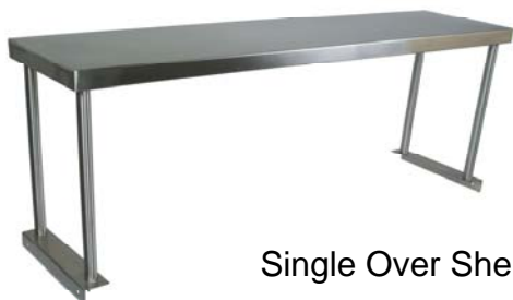
Single Over Shelf