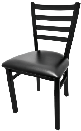
Black Vinyl Seat CM-234-BLK