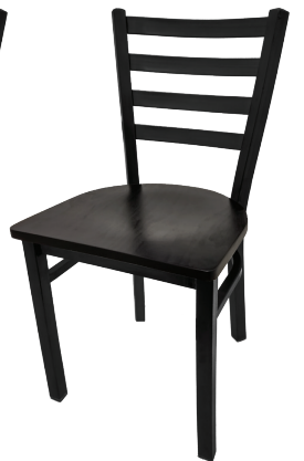
Black stain Wood Seat CM-234-WB