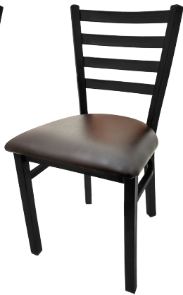
Espresso Vinyl Seat CM-234-ESP