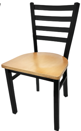
Clear Coat Wood Seat CM-234-N