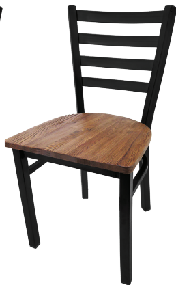
Reclaimed Wood Seat CM-234-RW