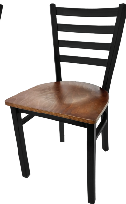
Walnut stain Wood Seat CM-234-WA