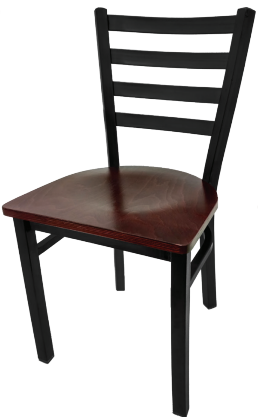
Mahogany stain Wood Seat CM-234-M