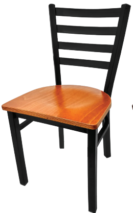
Cherry stain Wood Seat CM-234-C