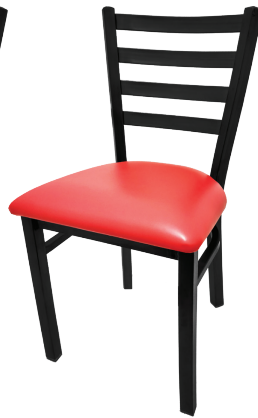
Red Vinyl Seat CM-234-RED