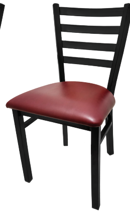
Wine Vinyl Seat CM-234-WINE