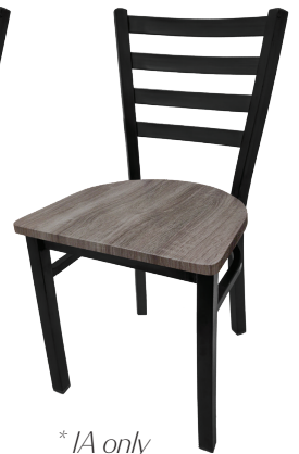
* IA only Barnwood Wood Seat CM-234-BW *