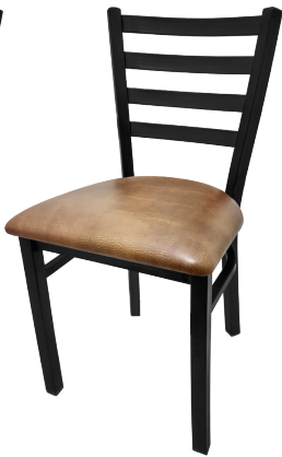
Buckskin Vinyl Seat CM-234-BUC